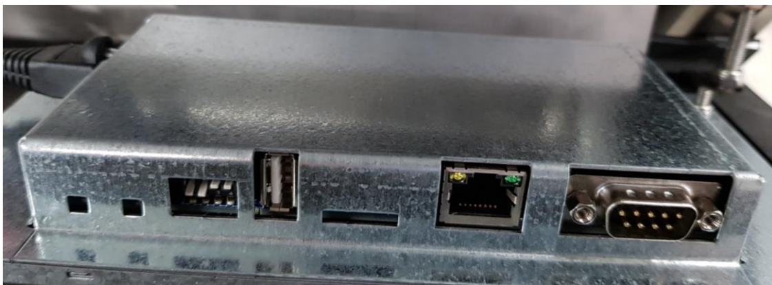
HMI loading side