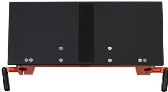
1. Lower Back Section

The Lower Back Section accessory provides options to configure and shorten the surgical table. This accessory allows the anesthesiologist better access to the patient when the patient is positioned toward the foot end of the surgical table.