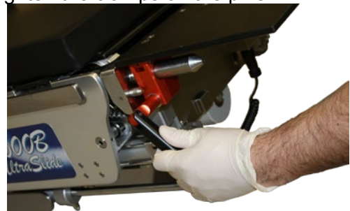
2. Tighten the Clamps