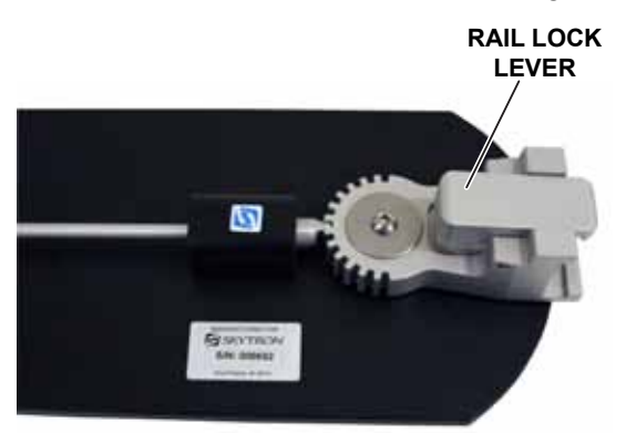
Figure 2. Rail Lock

c. Depress the rail lock lever and lift the armboard up to release it from the table side rail (Figure 2).