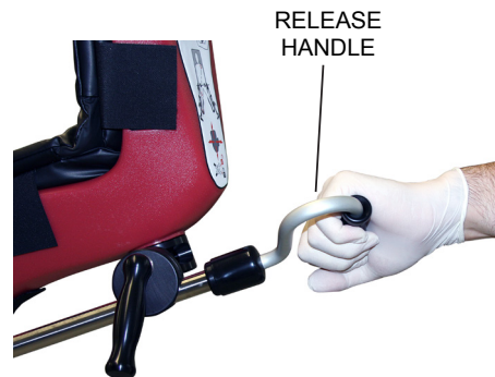
Figure 4. Leveling Stirrups