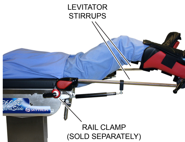
Figure 1. Skytron Levitator Stirrups

The Skytron Levitator stirrups and Heavy Duty (HD) Levitator stirrups are the standard for Lap Nissen, Urology, GYN, Endourology, Cystoscopy, and other procedures requiring low lithotomy, dual site exposure, or where intra-operative repositioning may be required. (Figure 1.)