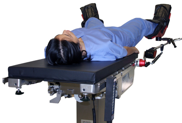
Figure 5. Thigh and Foot Abduction