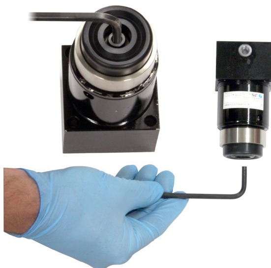
Figure 1. Pad Removal