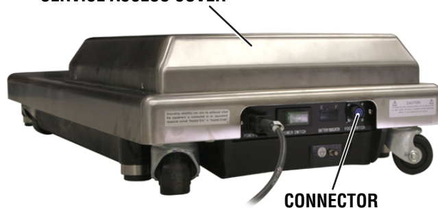
Figure 2. Access Cover