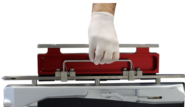
Figure 2. Open Clamps

Using the "U" shaped bar on the under side of the extension, open the clamps. (See Figure 2.)