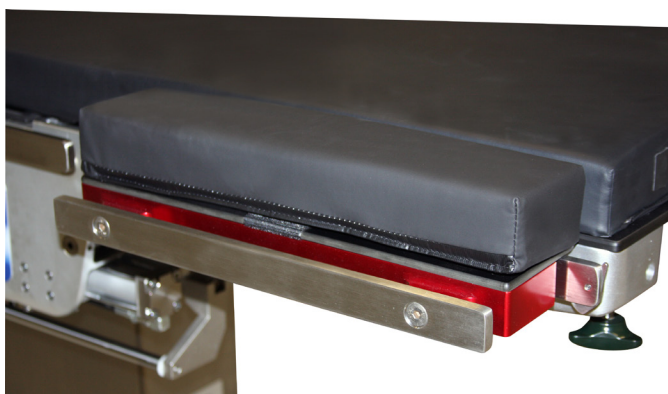
Figure 1. 3.5 Inch Table Side Extension

The 3.5 Inch Table Side Extension, shown in Figure 1, clips to the side of the table using an integrated clamp system to lock on to the side rail. The 3.5 Inch Table Side Extension extends the table surface to accommodate larger patients, and has an additional side rail to attach other accessories.