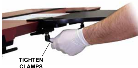
Figure 2. Secure Arm Surgery Board

b. Tighten both clamp handles to secure the arm surgery board in place, then pull on the board to ensure that it is satisfactorily attached (Figure 2).