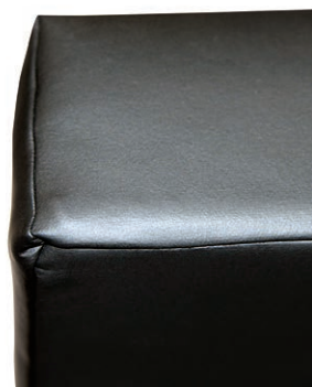
Welded Seam Pad

Unlike standard pads which allow liquids to enter between stitches and into the foam layers, Skytron pads are tightly sealed for cleanliness and durability. Ultrasonic welders are used to form a leak-proof barrier, 'welding' the seams and preventing liquids from entering the inner foam.