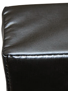
Standard Stitched Pad