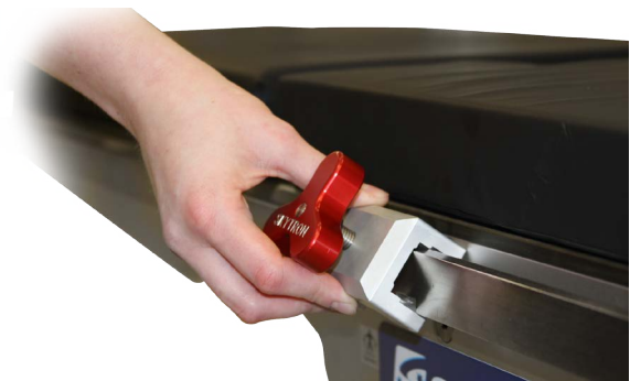
Figure 4. Clamp Over Rail Cut Outs