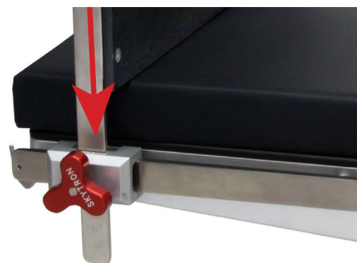
Figure 5. Clamp with Perpendicular Installation