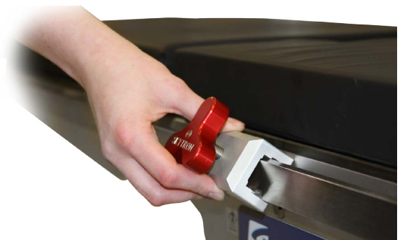
Figure 2. Clamp Over Rail Cut Outs