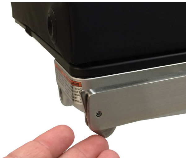
Figure 3. Gravity Stop